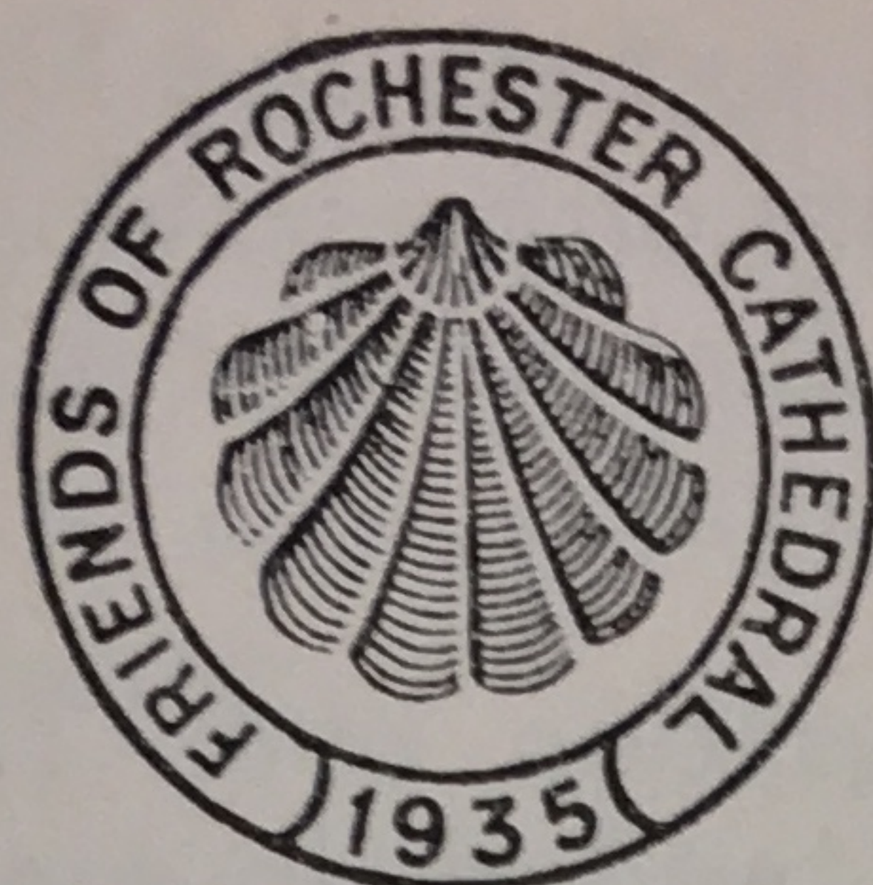
Badge of the Friends of Rochester Cathedral