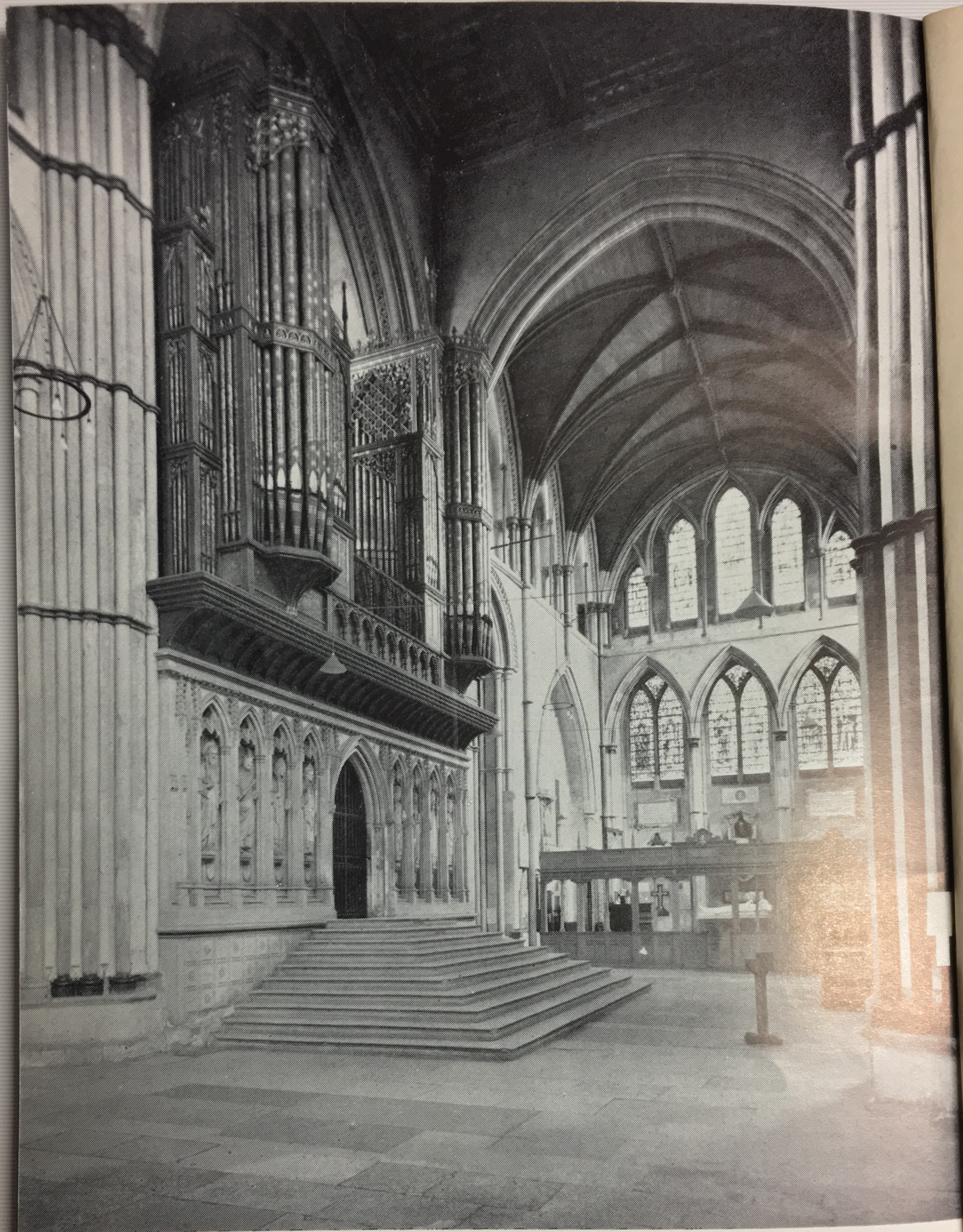
The Nave Crossing The Organ (to be restored)